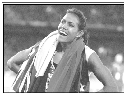
Cathy Freeman (the green house)