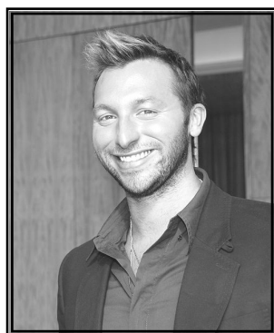
Ian Thorpe (the blue house)

the Butterfield family would be adopted. Cathy Freeman became the Olympic champion for 400m in the 2000 Sydney games. Ian Thorpe has won 5 Olympic gold medals, the most won by an Australian. Both are great inspirations to our students.