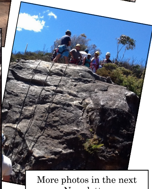
More photos in the next Newsletter