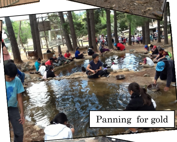
Panning for gold