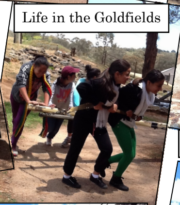
Searching for gold