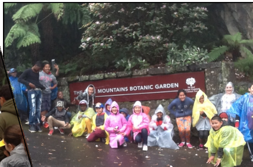
The Blue Mountains Botanic Garden