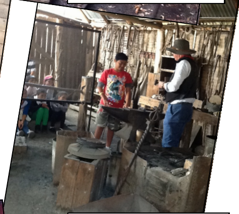
Helping the Blacksmith