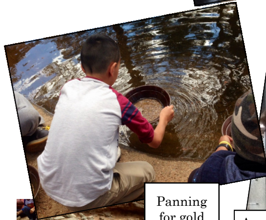
Panning for gold