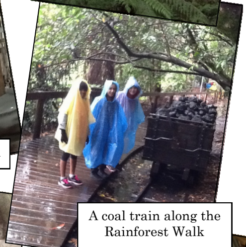
A coal train along the Rainforest Walk