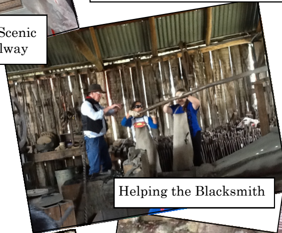
Helping the Blacksmith