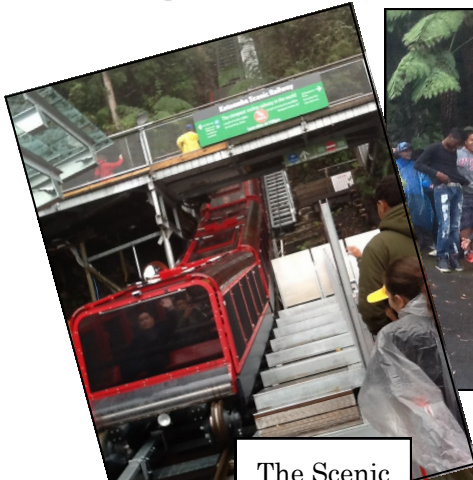
The Scenic Railway