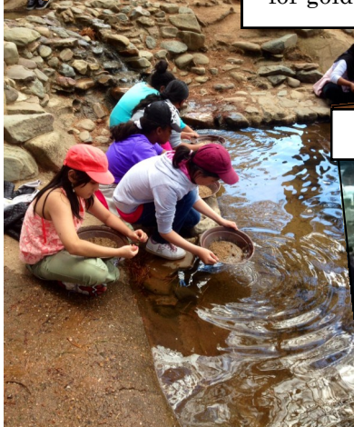
Looking for gold