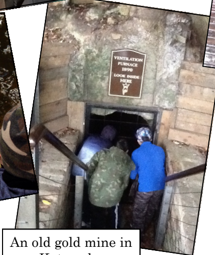
An old gold mine in Katoomba