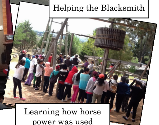
Learning how horse power was used