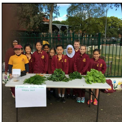
Granville Public School Garden Sale.