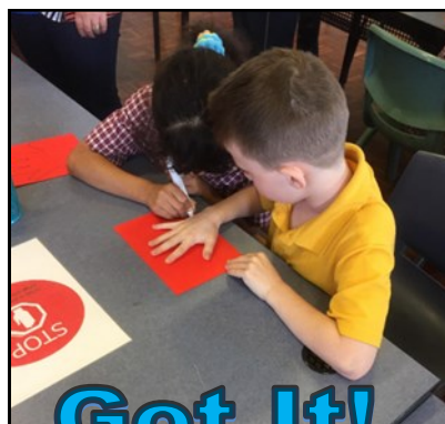
Group session on Tuesday 31 October 2017

Emotional moments can be an opportunity to teach your child and build your relationship with him. One way to do this is spending a few minutes each day talking with your child about emotional events happening in his life. This quality time might happen after school, after dinner, or at bedtime. Not all children will want to talk openly about feelings. Be patient and try talking when you are doing something together, like driving or doing household tasks. But if she doesn't want to talk, it is important not to pressure her. This is not the time to discipline; it is just a time for listening and reflecting your child's emotions. Over time, this will build your child's trust in you and help her to feel more comfortable with sharing her feelings.