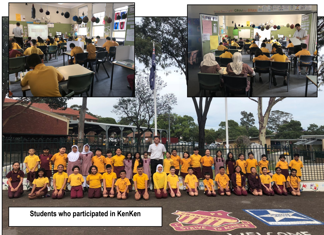
Students who participated in KenKen