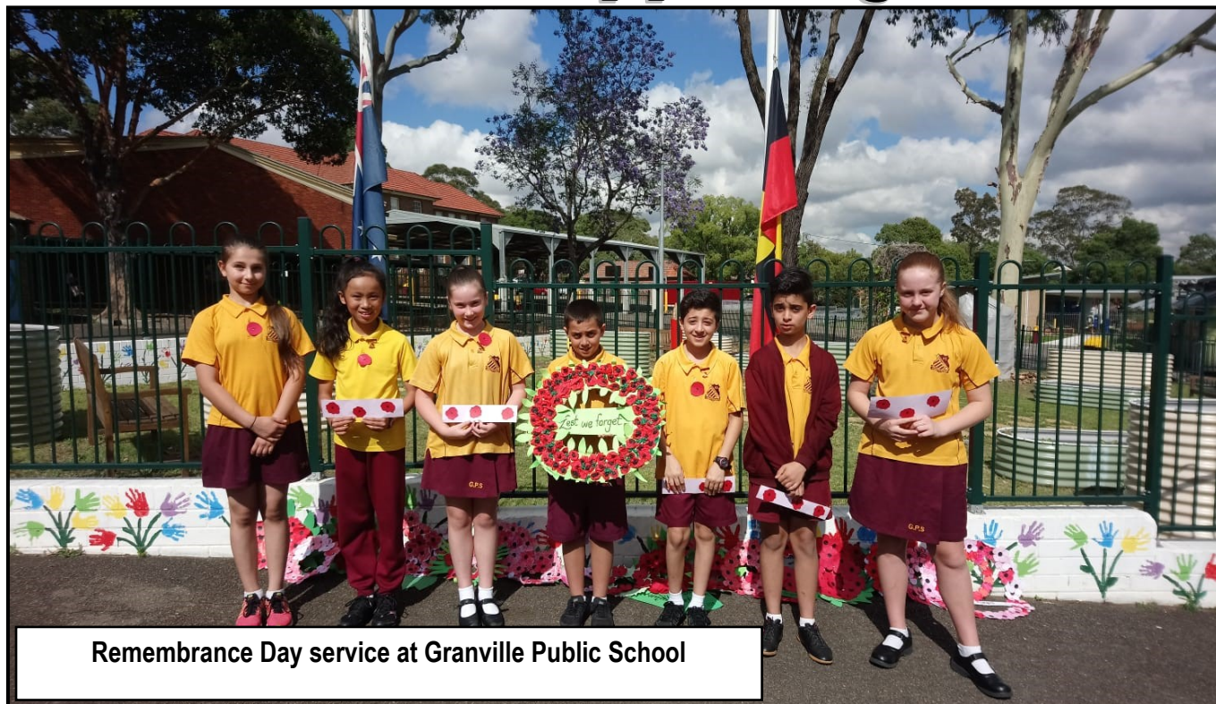
Remembrance Day service at Granville Public School